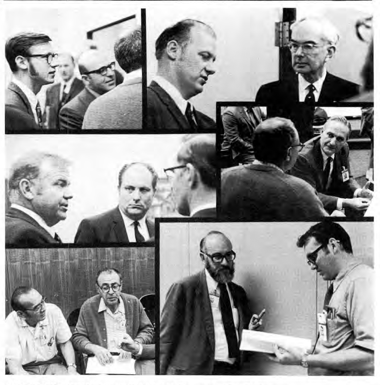
INFORMATION EXCHANGE during Metal Hydride Symposium at Sandia/Livermore.